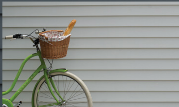
Linea Weatherboard 150mm

Unlike traditional timber, fibre cement weatherboards are stable. Linea weatherboards will maintain their integrity and appearance significantly longer than timber. Even when moisture gets in, Linea weatherboards resist swelling, shrinking and cracking to hold paint longer. So you can pick dark modern paint colours with confidence.