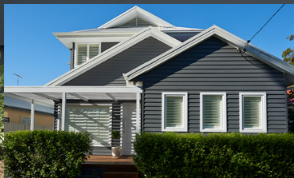
Linea Weatherboard 180mm